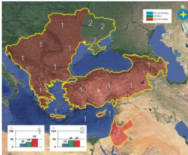
Figure 1. Graphical presentation of the 2023 summer temperature outlook

Temperature: According to the SEECOF-29 consensus, the statement temperature was expected to be above normal (upper tercile) with 50 % for all over the country. Verification showed that the summer period in the country temperature was above the norm, so the outlook for Georgia was correct.