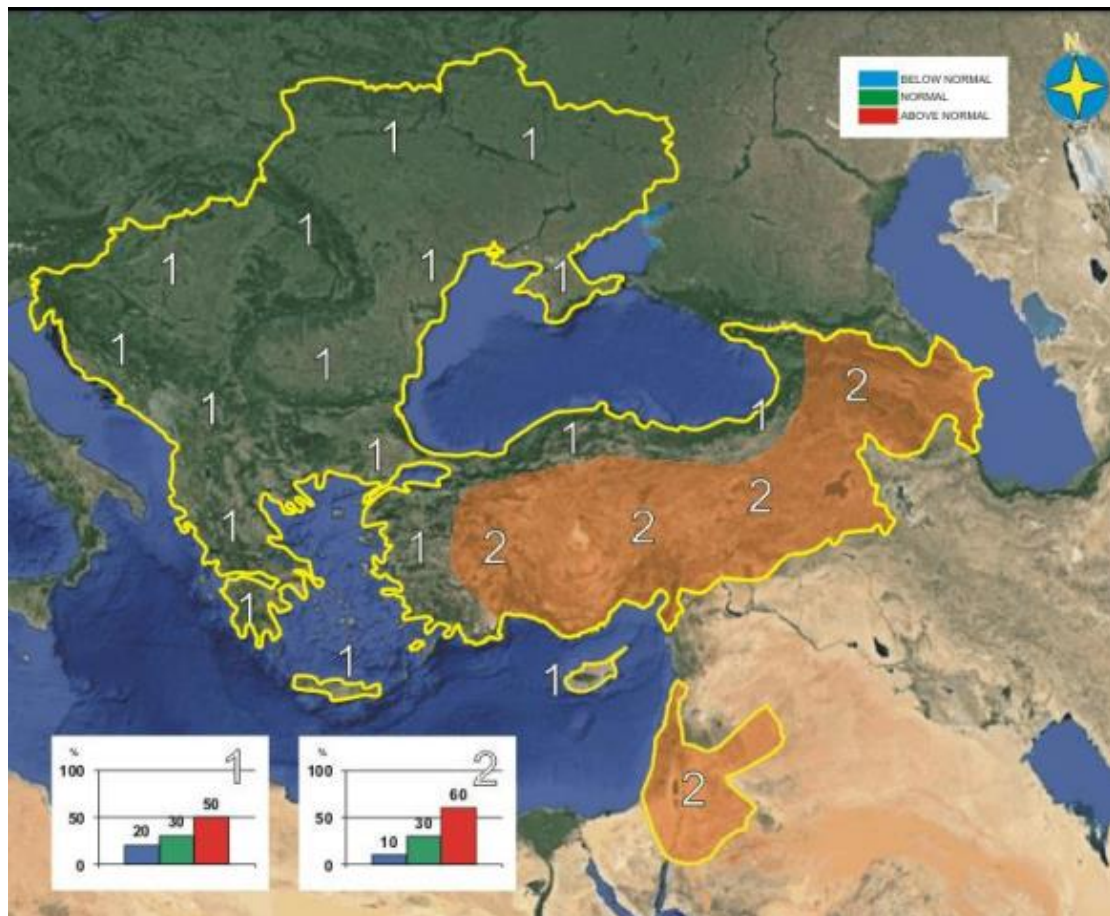
Fig. 1: Graphical presentation of the 2021 summer temperature outlook.

The SEECFO-25 temperature outlook assigned 60% chance for the “above normal” tercile, 30% for the “normal” tercile and 10% for the “below normal” terciles (fig. 1).